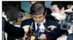
Prof Hwang Woo-suk

A South Korean scientist who falsely claimed to have achieved major breakthroughs in stem cell research has been found guilty of fraud.